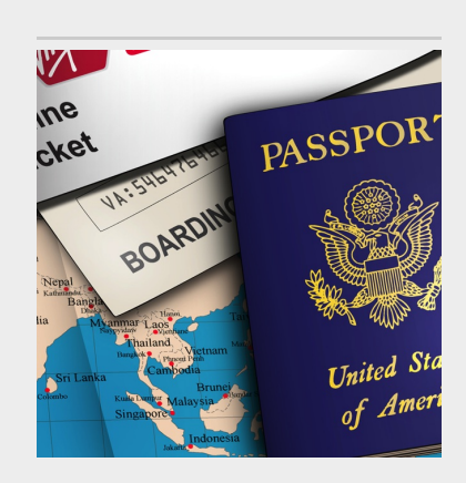
LONDON IS STILL

March 15th - 2:00pm Burruss Building 151